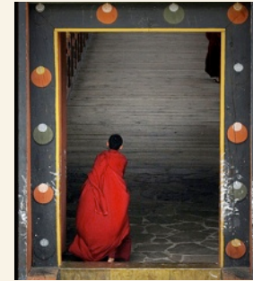
Young monk walking on the little Buddha bridge

Compete in an archery competition, trek up to the Tiger's nest monastery that clings to a vertical granite cliff 2,000 feet above the valley floor; Be part of a prayer ceremony with over a hundred monks at the Paro Monastery; Visit the ancient watchtower that houses the National museum of Bhutan.