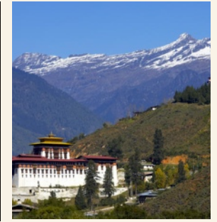
The Paro Dzong with snow capped peaks in the distance