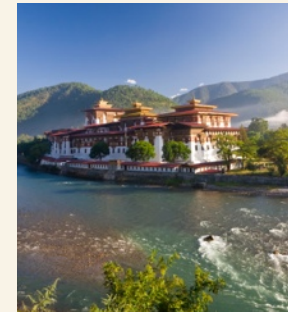
The Punakha Dzong

Punakha offers its visitors the first glimpse of the mesmerizing central - eastern Himalayan range; Spend the night in tented camps by the river; Visit the Punakha monastery in the company of a learned monk; Experience a hot stone bath; Trek up to the temple of the divine mad man.