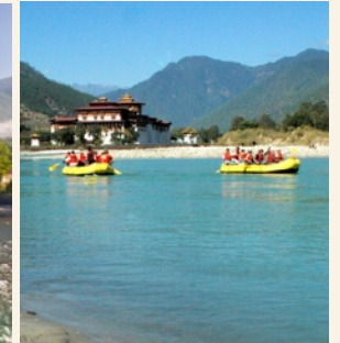
River rafts on the Mo Chu river.