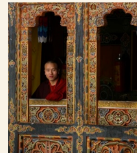
Monk at the Tasichbo Dzong

Established as the capital in 1961, Thimphu has a youthful exuberance that constantly challenges the country's conservatism and proud tradition. Crimson-robed monks, Indian labourers, gho- and kira-clad professionals and camera-wielding tourists all ply the pot-holed pavements, skirt packs of sleeping dogs, and spin the prayer wheels of Clock tower Square, and nobody, it seems, is in a hurry.